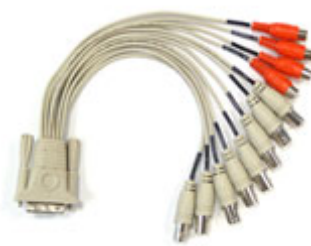
8 cam video cable